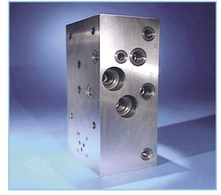
Above: Savings with continuous cast ductile iron bar stock are usually greatest in hydraulic components that require multiple machining operations.

Machining was done at 450 surface feet per minute using a feed rate of 0.010" per revolution. Sandvik Coromant coated carbide inserts, style CNMA in grade GC3015, were used for all tests. ( Editor's note: The current recommendation for tooling would now be CNMA style in New Grade GC3205—one of the recently released new series of cast iron turning grades from Sandvik Coromant. )