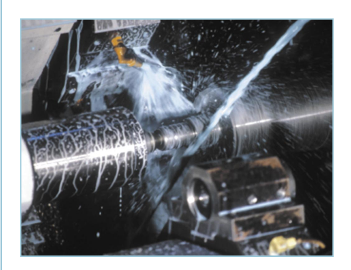
Above: Using continuous cast ductile iron in lieu of some free machining steels can save money by reducing machining cycle times by 25-50%.

Machinability studies comparing ductile iron and steel make it possible to craft some typical cost comparisons. For example, suppose a part made from 1212 steel bar stock is turning at 650 surface feet per minute.