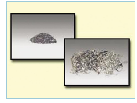
Above: Graphite contained in iron's ferrous metal matrix acts as a chip-breaker which dissipates heat and reduces tool wear.